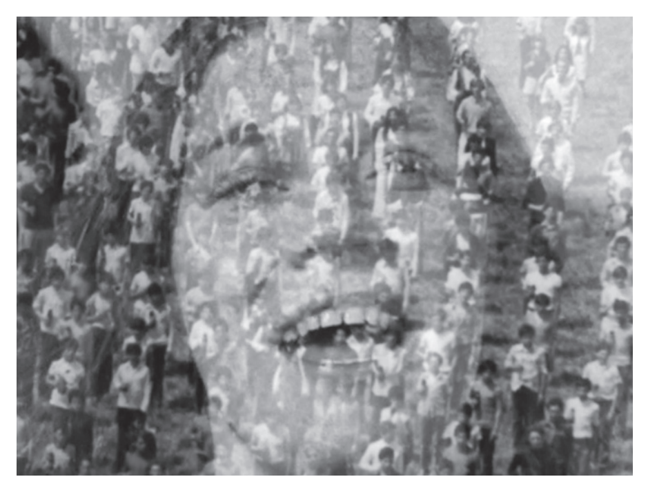
Fig. 5. MAD MEN. Waterloo S07E07. A Late Capitalist Version of the Body Politic

chorus are in turn blended together into a multi-layered composite image. At the end of the hilltop commercial, once the camera has moved into a long shot, the close-up of an enraptured young woman is shown, superimposed over the crowd, to unite all the separate figures into one collective body. We might read this as a late capitalist version of the body politic. We have not only left behind the realm of fiction, but the advertisement image itself has also been depleted of all referentiality. The scene it puts on display—in order to encapsulate the affective intensities of this historical moment of cultural transition, which is to say the transformation of counterculture into the language of consumer capitalism—taps into the singularity of this past even while transcending its specificity. Matthew Weiner's creation, MAD MEN, and the world his time traveling has evoked for us on screen each in turn dissolve into this temporal loop.