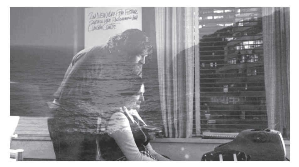
Fig. 2: MAD MEN. Waterloo S07E07. Lap Dissolve Connecting Peggy's Writing and Don's Anagnorisis