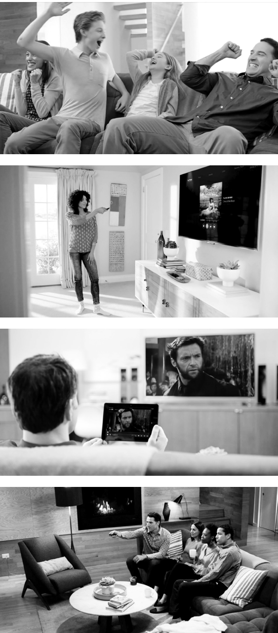
Fig. 1–4: The various body positions suggested in a commercial for Kindle Fire TV

transfers the film image from her tablet back to the bigger screen in front of them. 52