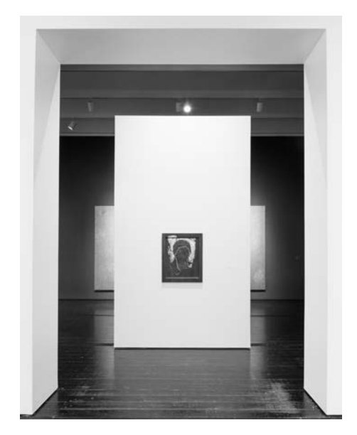
Fig. 3: Installation view of an icon of the Virgin Mary in Byzantine Things in the World , The Menil Collection, photograph: Paul Hester.

have something approaching Riegl's historical value in operation, but not entirely, "The more faithfully a monument's original state is preserved, the greater its historical value: disfiguration and decay detract from it.«<sup>19</sup> Decay was halted, and so some necessary part of the objects was preserved, but the original state was simply irretrievable by our standards, so that the icons escape full adherence to Riegl's definition of historical value