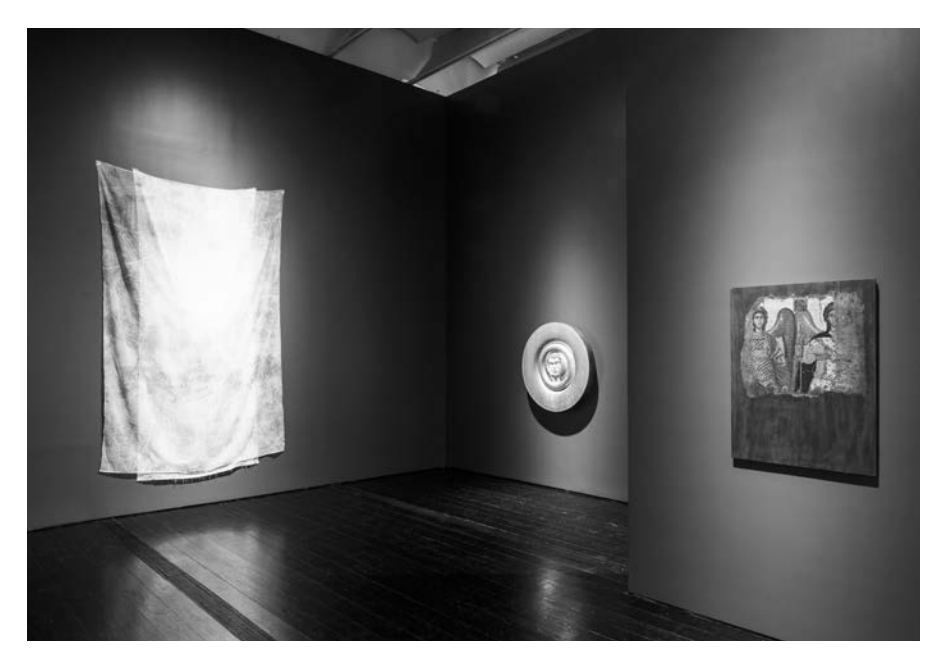
Fig. 4 and 5: Installation view of Byzantine Things in the World , The Menil Collection, photographs: Paul Hester.