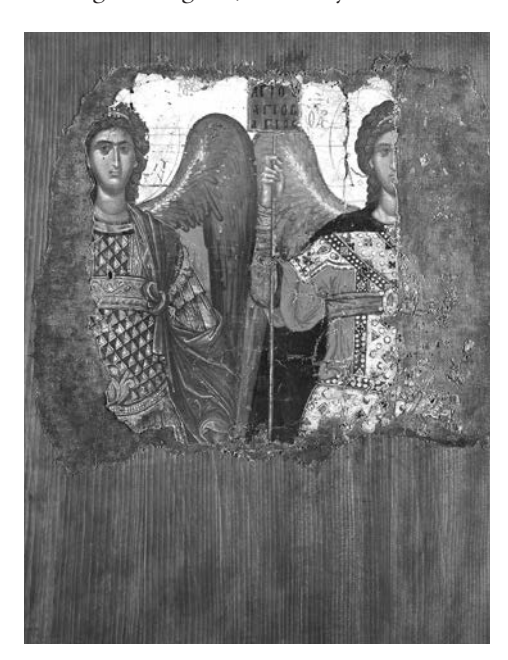
Fig. 2: Icon of the Archangels Michael and Gabriel, Late Byzantine. The Menil Collection.

The framing and suturing that embed these icon fragments in a new surround opens up fresh, and not very Byzantine, ways of experiencing that art. The guiding principle behind the conservation was clearly not a return to a faux-byzantine surround, but one that allowed the conservation to be visible, understated, and true in some fashion to a fixed state of the original, or at least of that original type. Here we